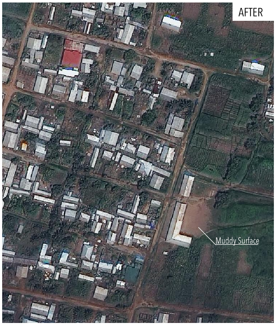
PLEIADES / 30 AUGUST 2020