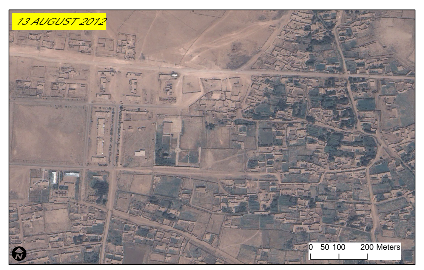
Figure 1: Kwanjanduko Flood Waters and IDP Settlement